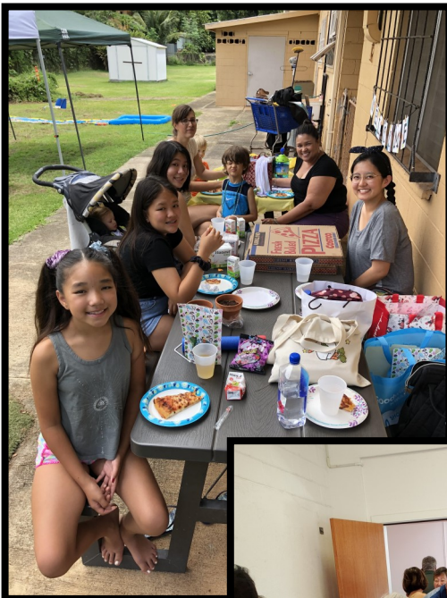
Vacation Bible School