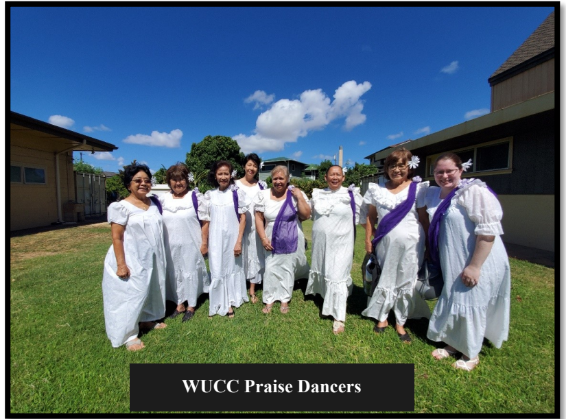
WUCC Praise Dancers